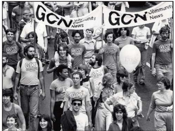
Gay Community News members, early 1980s

The HistoryMaker Award is presented to an individual or organization whose life-time achievements have had a significant and positive effect on Boston's GLBT communities. This year's recipient is the Gay Community News (GCN) Collective .